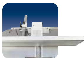
Planing Fence absolute rigidity

Professional planers at an accessible price, for woodworking shops and demanding craftsmen that require high standard and no compromises.