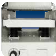
Thickening Table stability over time