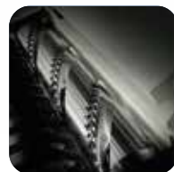
Xylent absolute silence