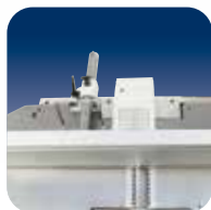
Planing Fence absolute rigidity

Professional planers at an accessible price, for woodworking shops and demanding craftsmen that require high standard and no compromises.