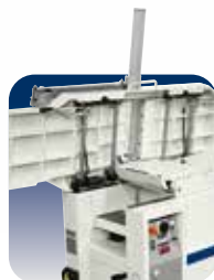
Surfacing Tables fast set-up